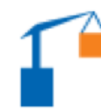
Erection All Risk