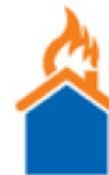
Standard Fire and Special Perils Policy