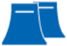
Boiler and Pressure plant