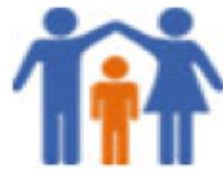
Mediclaim Individual & Group