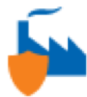
Industrial All Risk