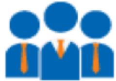
Directors & Officers Liability