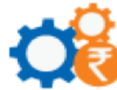
Machinery Loss of Profit