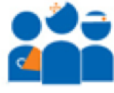
Group Personal Accident