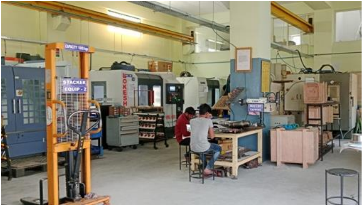
M/C-4: Campro CPV-1300 M/C-5: Lokesh VML-800 M/C-2: Lerinc V7

Email: info@excelcam.in , excelcam@gmail.com Website: www.excelcam.in