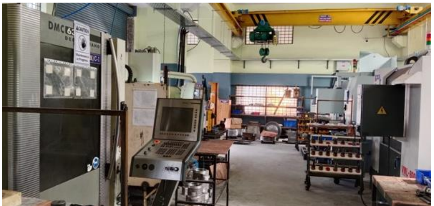
M/C-1: DMC 630 M/C-3: BFW Surya